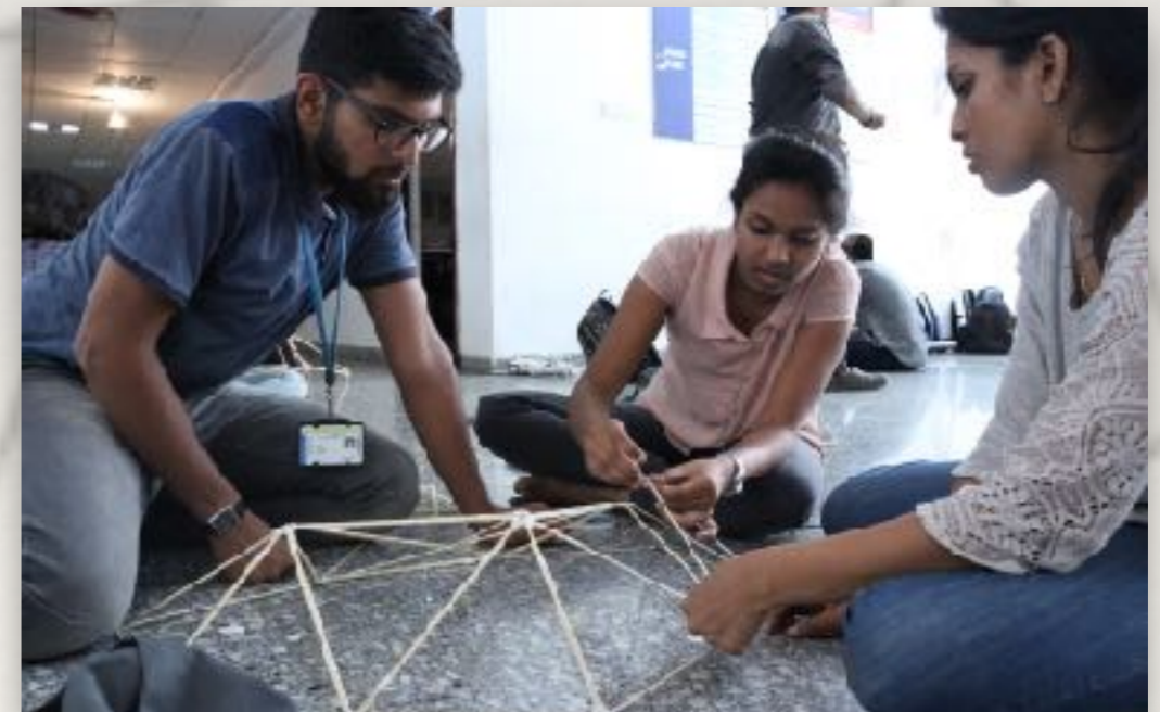
Students Working on the models