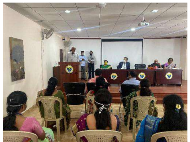
Secretary DSI addressing the Faculties.