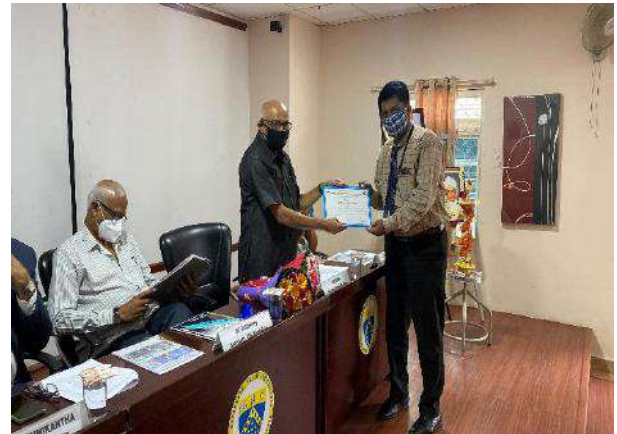
Faculty member offered a token of appreciation.