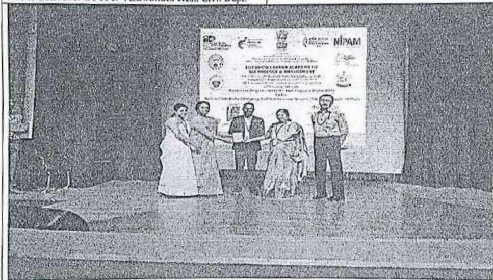
Felicitating the resource person by the IPR Cell, coordinator at DSATM